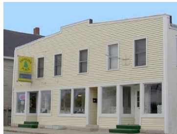
129 North Main Street Building for Sale- No Vacancies Winsor Brook 603-750-7501