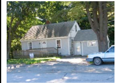
17 Sawyer Avenue Available SF: 1,207 (1 unit)