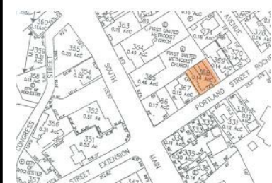
128 Portland Street Available: 0.14 acres in Special Downtown District Marsh Realtors 603-330-0010