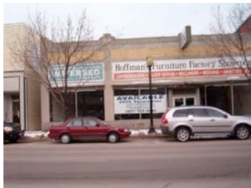
55 North Main Street Available SF: 6,000 (1 unit) The Haughey Co. 617-782-0012