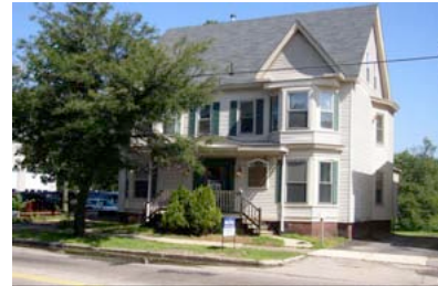
147-149 North Main Street Available SF: 2,500 (4 units) Winsor Brook Property Advisors 603-750-7501